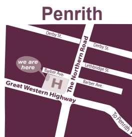
Nepean Private Hospital